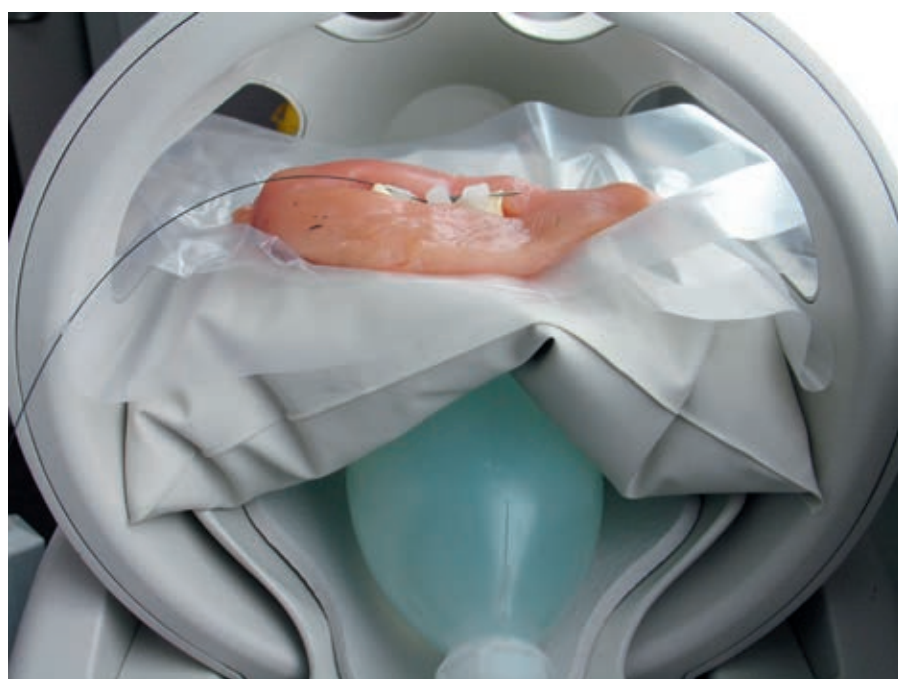
Shows the chicken breast phantom with a dental object placed directly on a dry human finger bone specimen. The phantom was fixed, and placed in the head coil of the scanner.

An additional safety concern is the possibility of dental objects movement or displacement due to the magnetic field strength. The extent of the interaction between the metallic object and the static magnetic field is proportional with the strength of the MRI system and characteristics of the object (mass, shape and magnetic strength of the object). According to the American Society for Testing and Materials (ASTM) international standard, a metallic object deflection angle of no greater than 450 is stated to be considered safe in terms